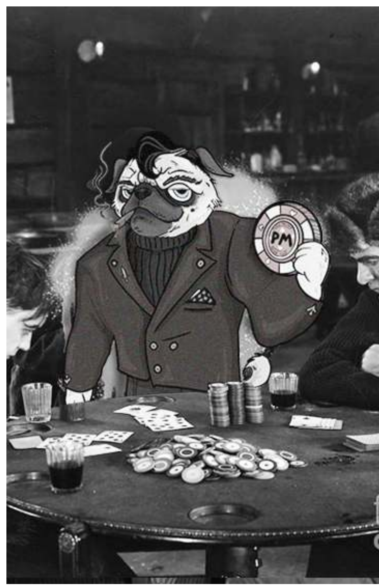
"Pugsy Malone is the underdog that puts people before profits."